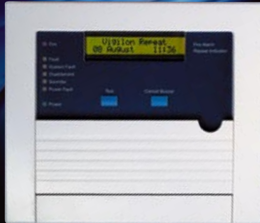
Vigilon Compact Repeat Panel

A maximum of 4 Repeat Panels can be connected to a Vigilon Compact control panel.