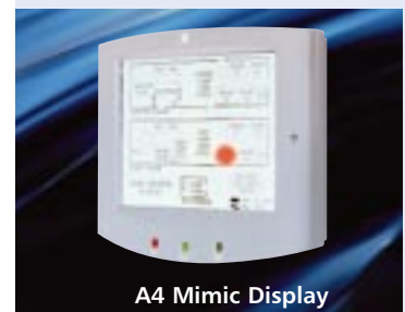
A4 Mimic Display