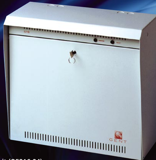
Power Supply Unit (O5216-24)

Fault monitoring to comply with BS 5839.