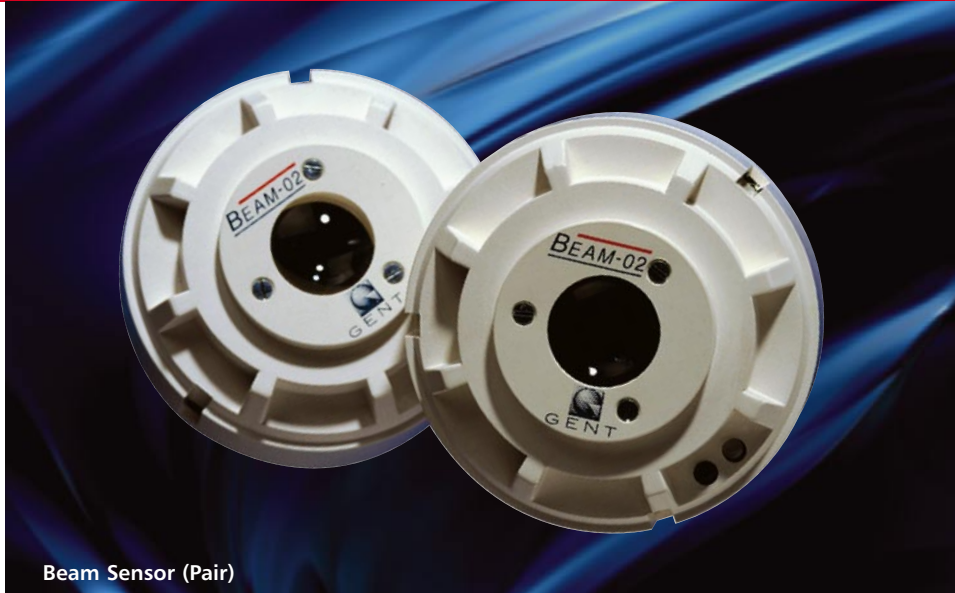
Beam Sensor (Pair)

Beam sensors are suitable for large open areas where installation of single point detectors may be difficult or uneconomical. These detectors come in pairs, one of which emits an infra-red beam, detected by the other unit. If the beam is broken by smoke, the sensor is triggered.