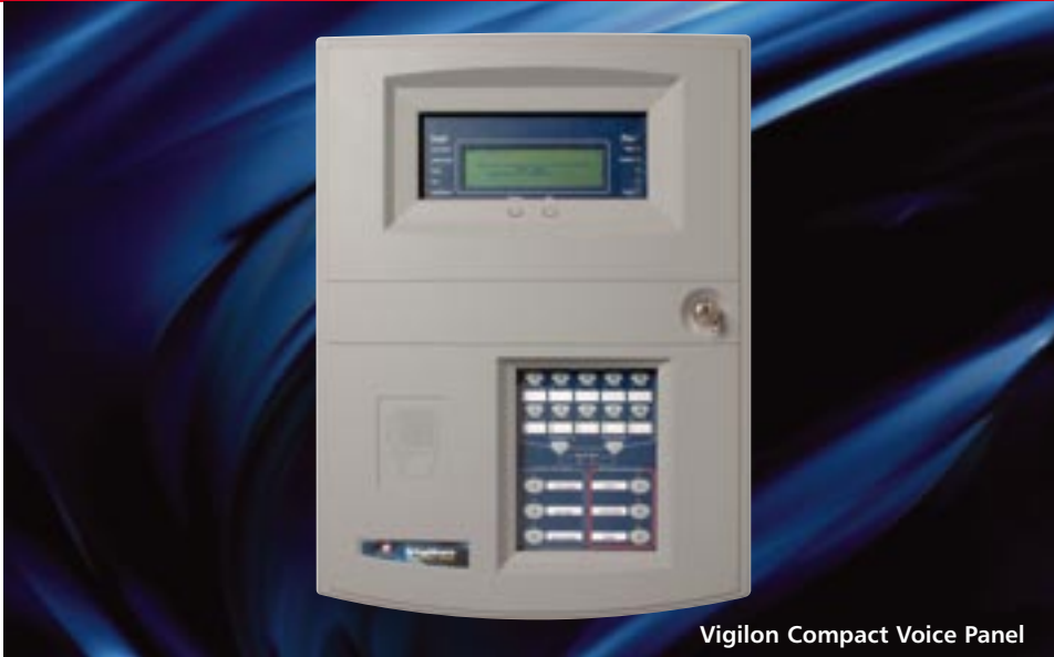
Vigilon Compact Voice Panel

A one to two loop panel accommodating up to 200 devices per loop (see Vigilon section for device details). Each loop can drive up to 5 DAUs and 5 voice evacuation zones.